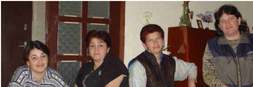
Women from Rustavi 18/19 th District fear for their safety living so close to the pipeline and want to be relocated.

The CAO report recommended that the BTC Co should provide clear information to the Rustavi community and arrange frequent community meetings in order to answer all the community's concerns. However, at the time of writing, these recommendations are yet to be implemented. This has resulted in significant disappointment among the community and increased mistrust of BTC Co. The residents said they believed that the local community liaison officer had neglected the importance of implementing the CAO recommendations, arguing that they are not mandatory and therefore unnecessary.