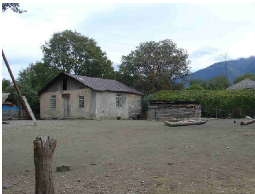
The School and playground in Agara village that residents claim BTC Co trucks are using as a car park.

Villagers estimate one to two hundred trucks drive through the village each day and believe they should receive compensation for this. A number of villages in the Akhaltskhe region have been blockaded to put pressure on BTC Co to water the roads, temporarily preventing dust.