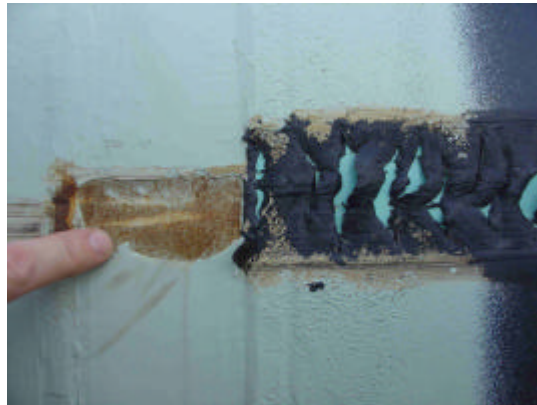
9 th October 2004, Pipeline laid by 18/19 th Districts, Rushtavi City

The product in question, a pipeline coating known as SPC 2888, has no track record on plastic coated pipelines. According to Mortimer, SPC 2888 will not ensure waterproofing and so leaves sections of the pipeline at risk of erosion. Despite this critical conclusion, BP has not replaced the protective material. The first line of the coated pipeline sections was completed in August 2003, and the first cracks were noticed in November the same year. Construction work was interrupted. By that stage, up to 15,000 sections had been laid in Azerbaijan and Georgia.