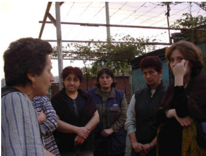
Residents of Rustavi City 17/18th District raise their concerns with the Mission

Mission Recommendation: BTC Co should closely follow its own Resettlement Action Plan and land acquisition guidelines, especially monitoring the behaviour of its own contractors, in order to compensate the land losses occurred. All disputes between the company and affected people should be solved through the independent dispute resolution mechanism.