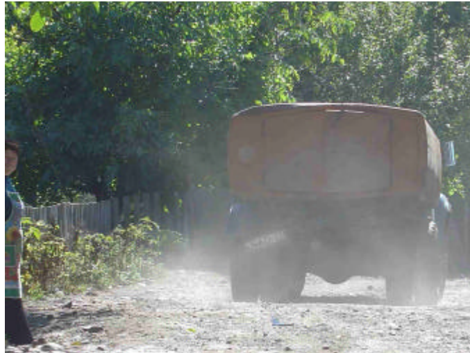
Water Truck delivering Water to Tsemi Village, Borjomi, 12 th Oct 2004

According to another villager in Tsemi, the water has been polluted since May. As compensation, BTC Co sends a container of water to the village every second day; but it does not deliver to every affected household. The villagers do not know where this water comes from, and are concerned the container and the pipe for water they see are dirty.