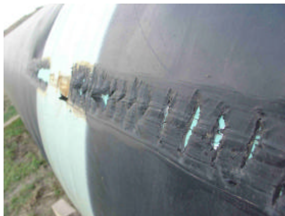
9 th October 2004, Pipeline laid by 18/19 th Districts, Rushtavi City

According to the WorleyParsons Desktop Report, carried out for the BTC Co, by early February 2004 at least 26% of joints welded and coated in Georgia were known to have developed cracking problems. 4 In addition to the cracking, the SPC3888 coating does not stick to the polyethylene outer surface of the pipeline; and therefore peels off. An internal BP report of 18 th June 2004 recorded that the plastic coating on the pipeline in Georgia had peeled away from “a large proportion” of the steel pipe. 5