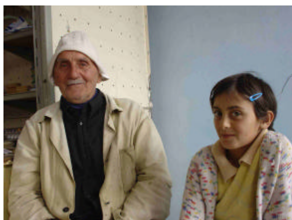
Residents of Sakuneti Village. The Mission were informed that community land set aside for future generations has not been adequately compensated.

Villagers in Sakuneti, Akhaltsikhe, told the Mission, that the pipeline will cross land set aside for the construction of housing for future generations.