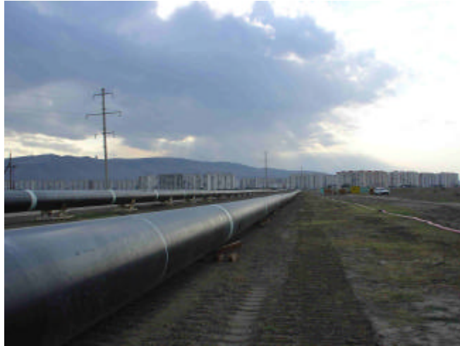
Pipeline next to Rustavi Districts 17/18 th