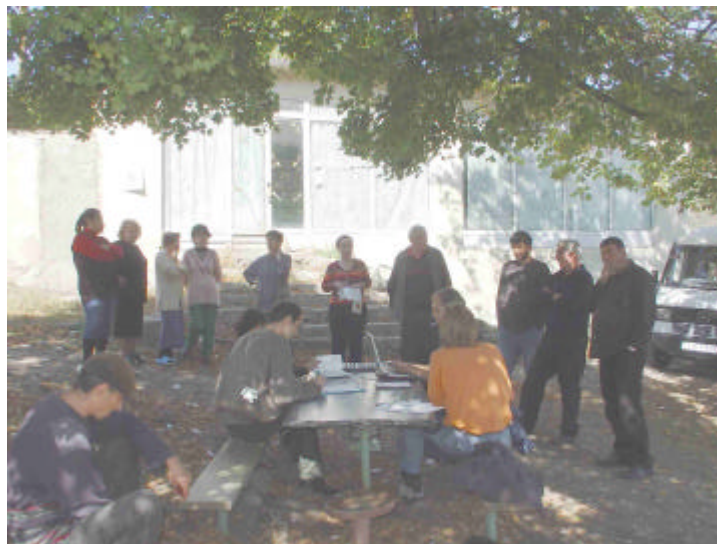
Villagers of Tsemi gather to inform the Mission of their concerns relating to the BTC Project.

Villagers in Tsemi have no running water, so drink brook water; but villagers claim that this water source is “very little and far away from the village” [500 m]. Villagers told the Mission that the amount of water delivered by BTC Co is not enough for everyone, so each household must go to collect water for their house every day. The villagers have had journalists coming from France and Germany to assess their water and these tests concluded the water was contaminated. Villagers complained to the Mission that nobody from the BTC Co had explained to them what was going on with the water pollution.