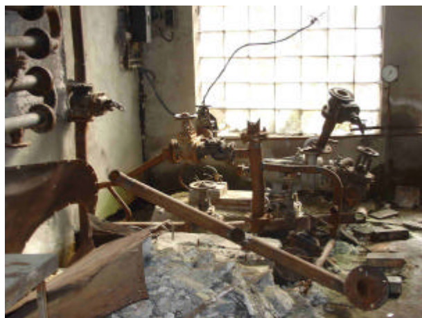
The water heating system at Tsemi had to be dismantled due to water pollution villagers claim is due to BTC Construction activities.

“BTC brought benefits for the government; but local people have nothing! We had such great water here and they brought all these tractors and destroyed it. They have not done anything for us. Their biggest mistake was to cross the Borjomi region! They have destroyed our road, the tourist season has been totally lost, the income source the village had, they destroyed it! The only opportunity we have to earn a living was taken and our water has been ruined since the BTC Co started construction here.”