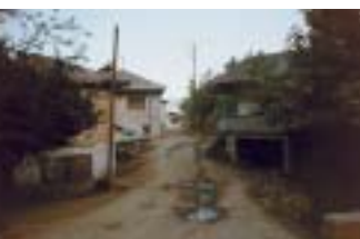
Akifiye village