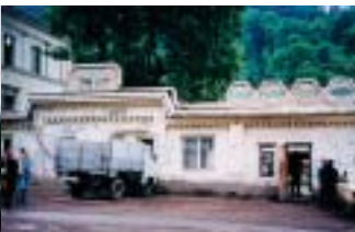
Borjomi mineral water bottling factory