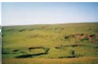
Near Ts'alka