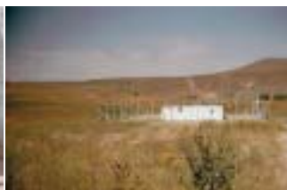
Gas pumping station, NGP – east Anatolia