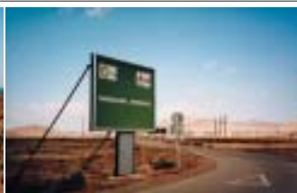
The Sangachal terminal