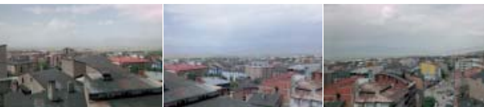
The view north from teh city of Erzurum. The BTC pipeline would pass this side of the mountains