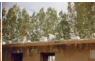
Beekeeper, Haçibayram village