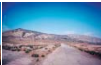
Gobustan desert