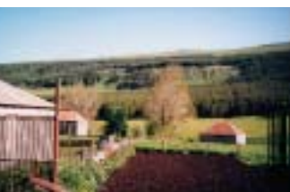
Imera village