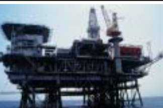
BP's Chirag-1 Platform