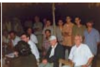
Akifiye villagers