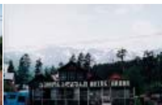
Bakuriani town