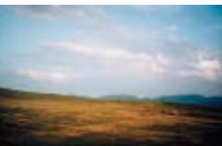
Kura-Araks Lowlands