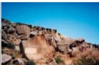
Gobustan National Park