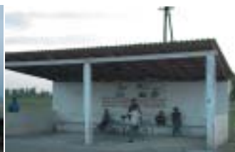
Bus stop, Shahliq village