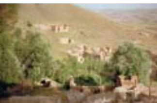
Ruins of Haçibayram vialle