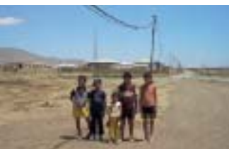
Umid village