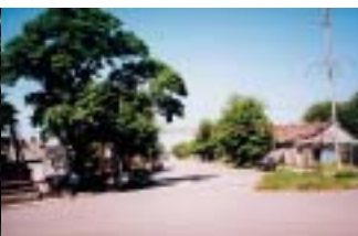
Tetri Ts'karo town