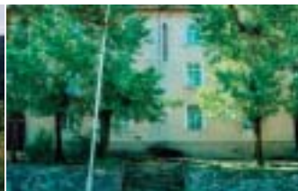
Vale town