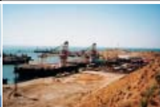
The Caspian Shipyard Company