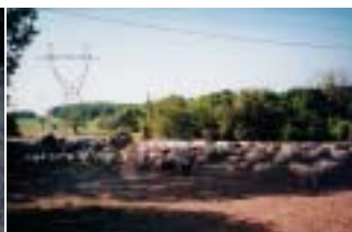
Ivanovka