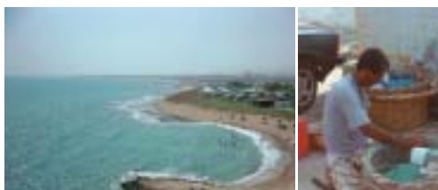
Coast near tanker terminal, Yumurtalik