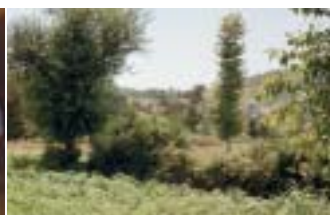
BTC route through Kahramanmaraş