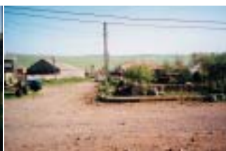
Beshdasheni village