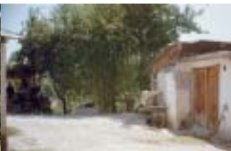
Kesim village