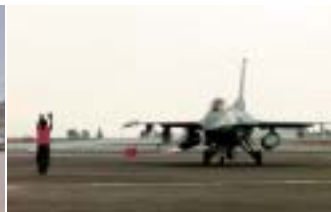
NATO airbase at Incirlik