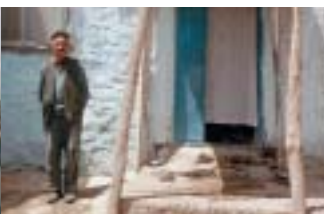
Villager, Uzunahmet village