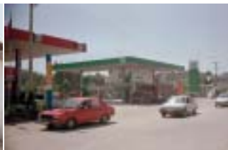
BP at Kadirli town