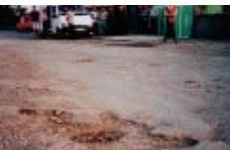
Agtagla village – road damage