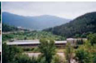
Borjomi mineral water bottling factory