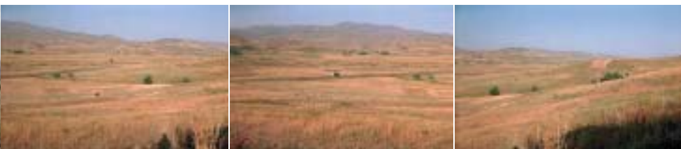
The NGP pipeline passes Pirede village on the same route BTC would follow