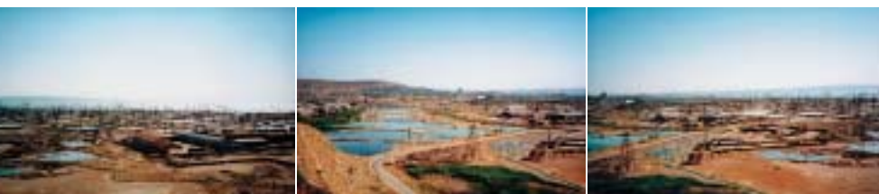
Onshore fields south of Baku