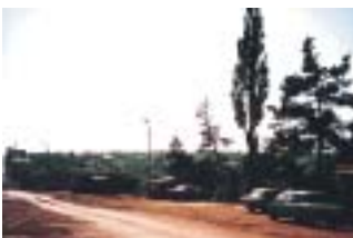
Ts'alka town