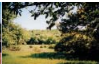
Trees to be cleared – Ivanovka