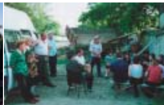
Villagers, Akhali Samgori