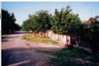
Akhali Samgori village