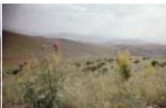
Meadow – crossed by pipeline