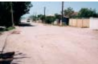
Kesalo village