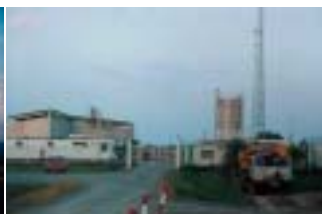
Pump station, Baku-Supsa pipeline