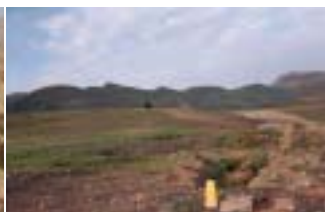
Scar caused by the NGP pipeline